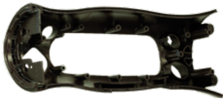
Visijet SL Black

The wide range of Visijet SL engineered materials offers the toughest and the highest quality parts to meet a broad range of commercial and production applications.