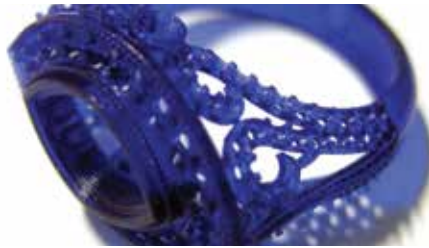
Visijet SL Jewel