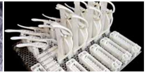
Visijet SL Impact