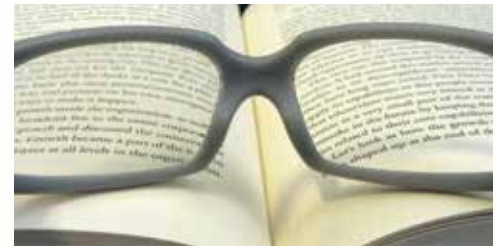
Visijet SL Tough (frame) and Visijet SL Clear (lenses)