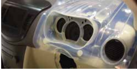
Various Accura materials for form and fit tests of a dashboard

Plastic and composite parts made from Accura SLA materials are the industry's "gold standard" for accuracy, providing excellent resolution, surface finish and dimensional tolerances. Accura SLA materials offer the broadest choice of materials in 3D printing and can easily be optimized for specific prototyping, casting, tooling and direct manufacturing applications.