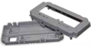
Electronic housing prototype printed in Accura Xtreme