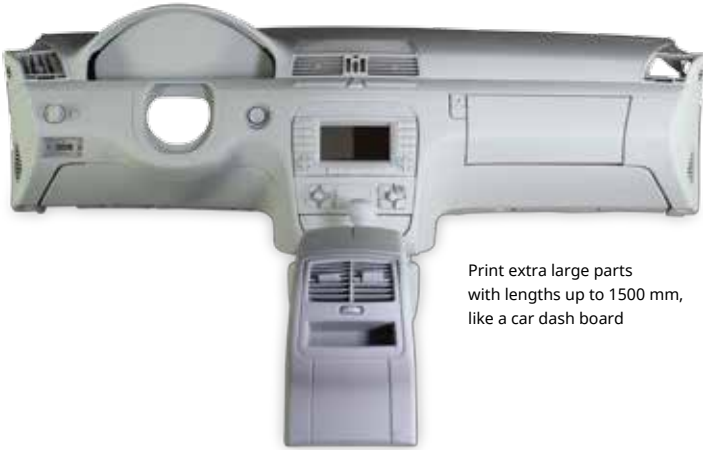
Print extra large parts with lengths up to 1500 mm, like a car dash board

3D Systems, the inventor of Stereolithography (SLA), brings you legendary precision in 3D printers, fine-tuned for cost-efficiency and unrivaled material availability. These advanced 3D printers produce exact plastic parts without the restrictions of CNC or injection molding. In addition to prototypes and end-use parts, these SLA printers create casting patterns, rapid tooling and fixtures. With speed, accuracy and surface quality of this level, you can produce low- to medium-run parts at a lower per-unit cost and build massive, highly-detailed pieces faster.