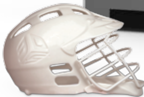
Helmet model printed in Accura Xtreme White 200